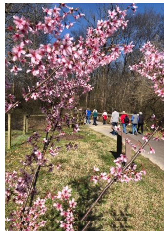
Hikers crossing trail bridge with blooming cherry tree in foreground.