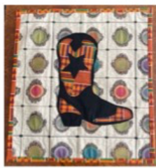
CRAFT: Quilting Machine Small – Kenta Boot Winner: Willa Brigham