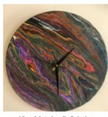
Visual Art: Acrylic Painting – “Time Gone By” used old 33 rpm record as base Winner: Barbara Sawyer