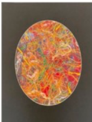
CRAFT: Basic Embroidery Thread Art in Black Oval Winner: Willa Brigham

1 st Place Winners – to be presented at State GFWC Arts Festival