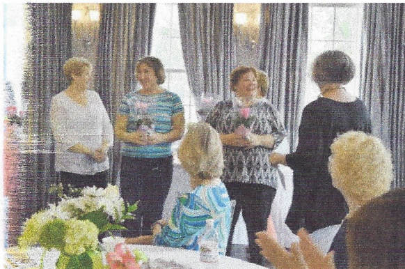
Induction of New Members