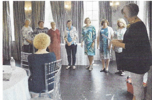
Installation of New Officers